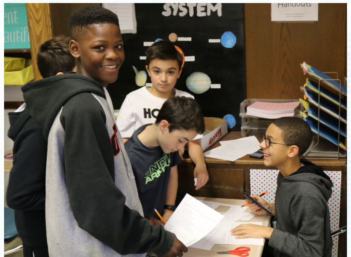
Innovative Middle School teachers make learning fun and relevant with 'Percent Town,' an authentic learning lesson where math students participate in a real-life experience involving percentages.

The number of College applications sent out from HHS students this year is over one thousand. In the past five years, the number of applications submitted to colleges by the November 1st deadline increased 244%. This indicates a culture shift in students' awareness about college applications and being savvy about the process and the advantage to applying early.