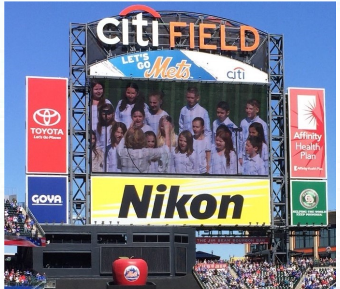
Pines students sing the National Anthem on opening weekend of the best season start in Mets' history

Yes, both projects funded by the capital reserve funds are still eligible for State building aid. Currently, the State reimburses the District approximately 55 percent of the total eligible project costs over a 15-year period.