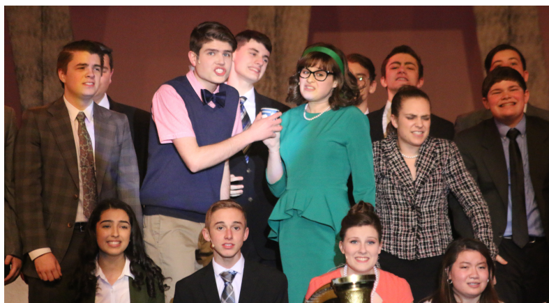
The High School's production of the musical comedy How to Succeed in Business Without Really Trying was a big success.

VOTE! Tuesday, May 15, 2018 - Your Vote Counts!