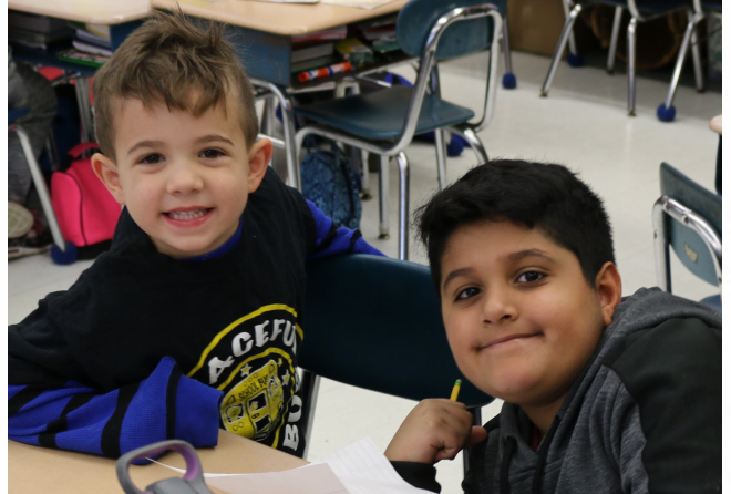
Pines' Peaceful Bus Program builds relationships and teaches respect as students mentor younger students.

Please visit the website at www.hauppauge.k12.ny.us for more details about the proposed 2018-2019 budget.