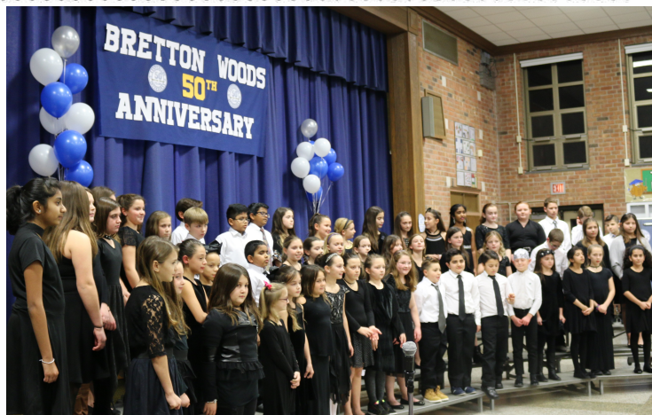
Bretton Woods turned 50 with a community celebration.