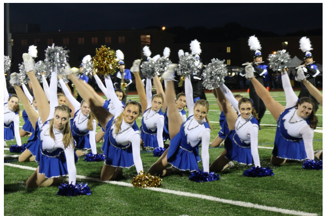
Homecoming's impressive half-time show featured crowd pleasing performances by Hauppauge's marching band and nationally ranked kickline and cheerleading teams.