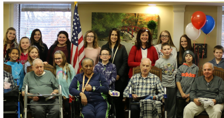
Character building and compassion are hallmarks of the educational program in the Hauppauge Public Schools. The Forest Brook Veterans' Voices Club constructed biographical booklets individually crafted from the memories of residents of The Arbors.

These and other exemplary student accomplishments are distinctly correlated to the dedication of our concerned families, talented staff and overall community support. We are proud of our students' accomplishments and greatly look forward to many more wonderful successes this year and every year!