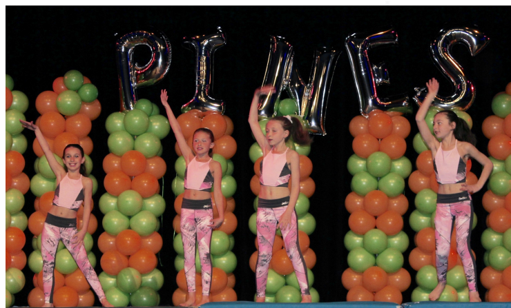
Pines annual Kids' Choice Talent Show was a huge success raising more than $8,000 for a Hauppauge community family in need.