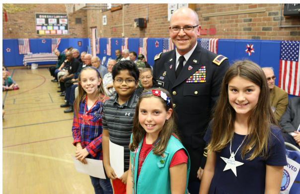
Bretton Woods honors Veterans with love and gratitude for their service to our country