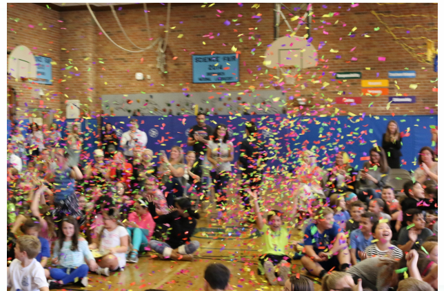
Forest Brook had the top reader in the nation and every one of the classes placed in the top 15 in the country in the LightSail Reading Challenge.